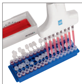
Access to tube racks